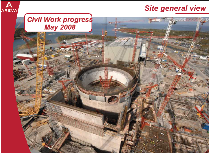
Site general view