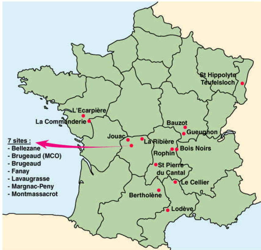
Figure 1-1 : Localisation géographique des principaux sites géographiques de stockage de résidus de traitement de minerai d'uranium

repositories, the evaluation of the risk involves the definition and analysis of different scenarios, based on consequences of climatic and geodynamic events and events caused by human intrusion.